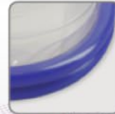
extension of incision site